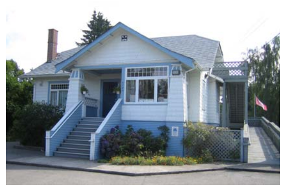
Front Entrance with wheelchair access.

4780 Blundell Rd. Richmond, BC V7C 1G9 Phone: 604-272-0459 Fax: 604-272-0491