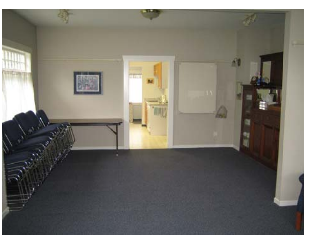
Living & Dining Room